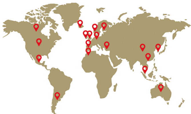
Map showing the destinations where AUC students went on exchange in 2025

AUC students who meet the requirements can choose from 11 AUC partner institutions and may also apply to partner universities with which the University of Amsterdam has a university-wide exchange agreement and European partner universities of VU Amsterdam.