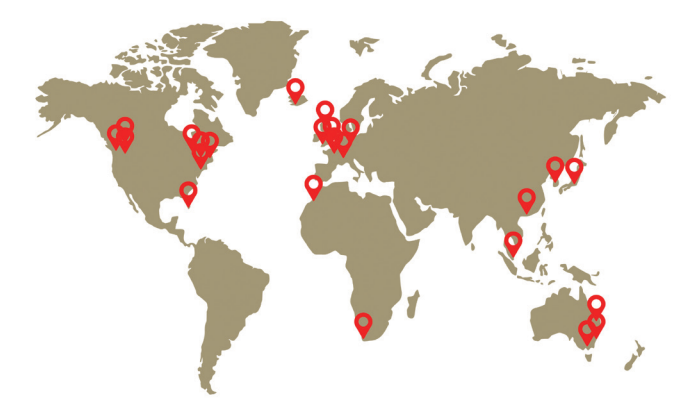
Map showing the destinations where AUC students went on exchange in 2023

AUC students who meet the requirements for exchange are encouraged to study abroad during their fourth or fifth semester. They can choose from 12 AUC partner institutions. In addition, they may apply to partner universities of the University of Amsterdam or European partner universities of VU Amsterdam.